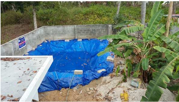
Pond under construction in February

Well done Peter – all savings will help!